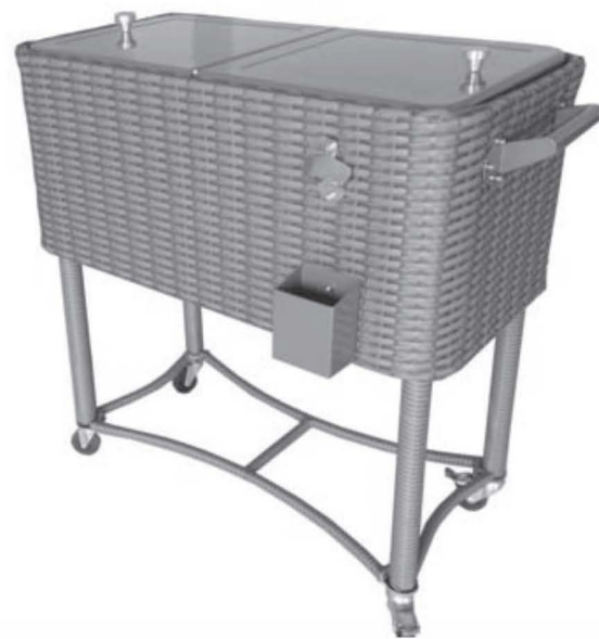
80QT CANE COOLER